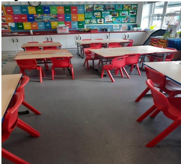
P2/3 classroom completely refurbished.